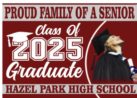
Hazel Park High School Yard Sign- Custom Photo