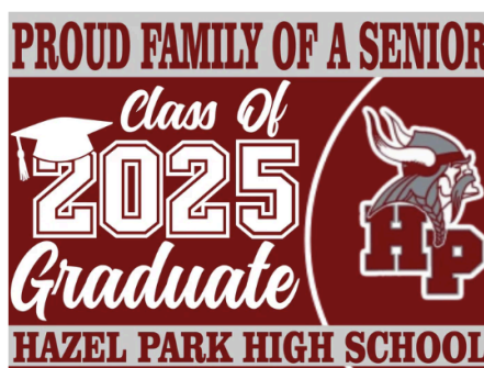
Hazel Park High School Yard Sign- Logo