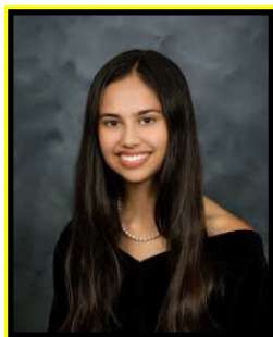
PHOTO REQUIREMENTS (see examples below): Senior year is a special one, and your senior headshot should reflect the best version of you! Please see sample images below for an appropriate look for your special senior photo. Whether you choose to take your photo in-studio or here on Friday, December 1st, make sure you are dressed to impress! Our school dress code policy applies to photos, too. After your picture is taken, make sure you select it through Prestige by the deadline of 12/13/23. Photos NOT selected through Prestige by this deadline will not be included in the 2024 Yearbook.

To be clear, only special senior photos taken with Prestige will be published. Again, for your convenience, their photographers will be at our school on Friday, December 1st to take headshots. Once your photo is selected for the yearbook by, Prestige will ensure it gets delivered to the yearbook staff.