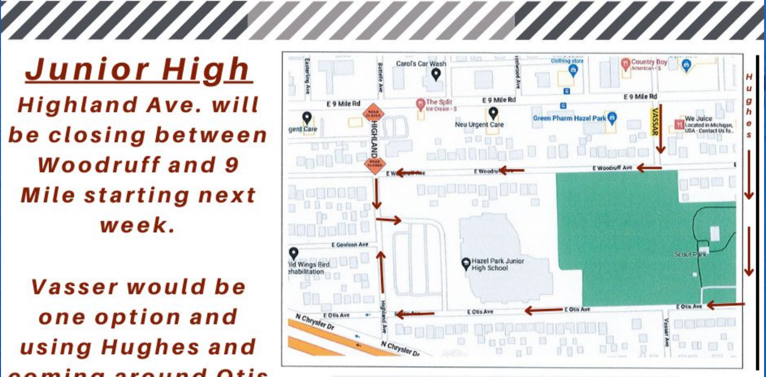
Highland between 9 Mile and Woodruff will be closed to repair the road.

Vasser would be one option and using Hughes and coming around Otis would be another.